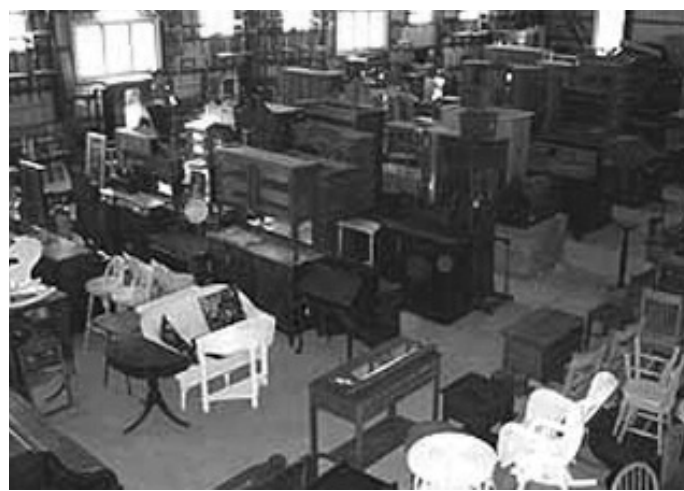
The fascinating facility encompasses over 7,000 square feet of ever changing vintage furniture and accessories, plus another 1,500 square feet of custom furniture items.