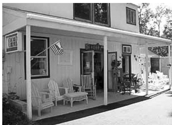
Kelly's Antiques and Furniture Barn is located at 6176 Old US 31 South in Charlevoix.