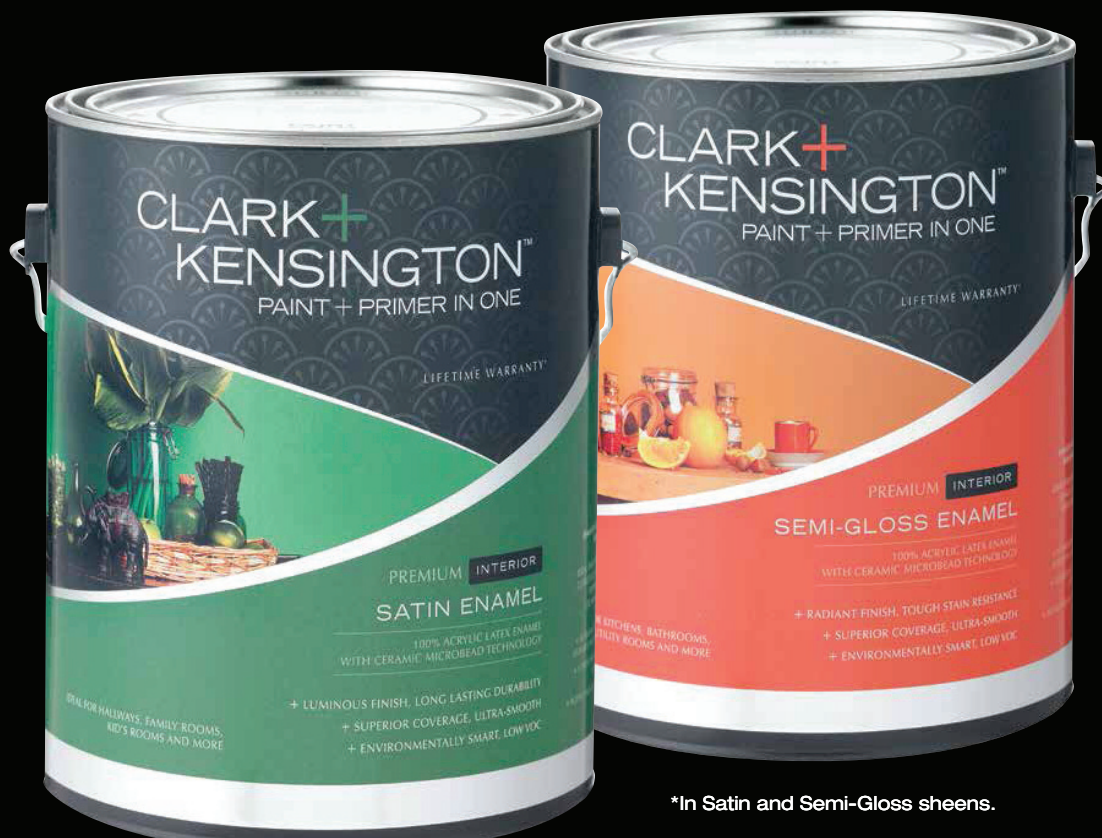
*In Satin and Semi-Gloss sheens.

Exclusively available at your neighborhood ACE