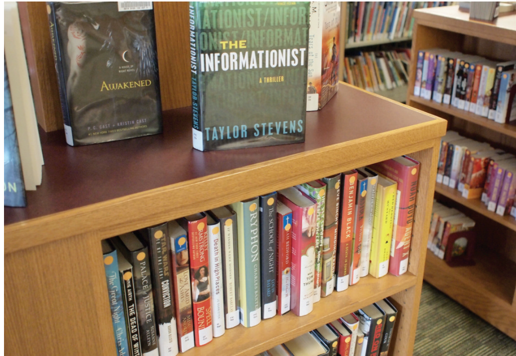
What better way to celebrate National Literacy Month than by picking up that book on your shelf or in your local bookstore that you've been meaning to read?

If you're looking to own some books, new or used, there are many places to find them in Otsego County. Book Swap on S. Otsego Avenue, Saturn Booksellers on Main Street, Orion & the Stone Unicorn on S. Otsego Avenue, Goodwill and Salvation Army are all