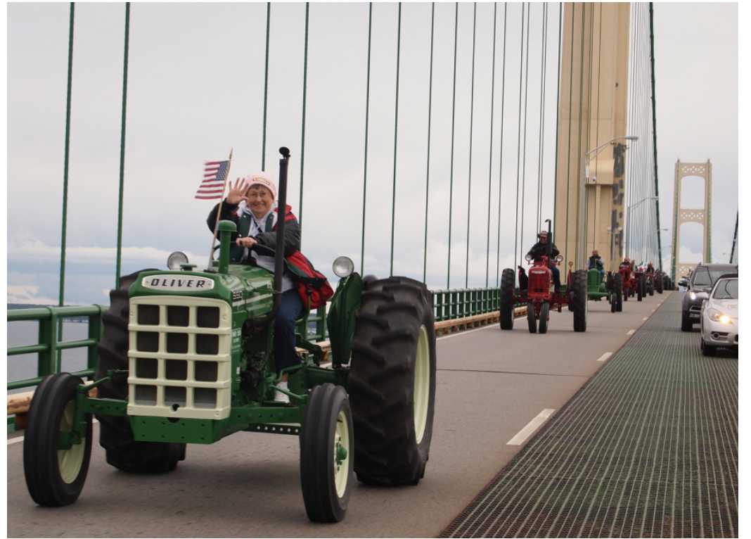
TruckTractor2013Photo2; Welcome the 6th Annual Mackinac Bridge Antique Tractor Crossing!